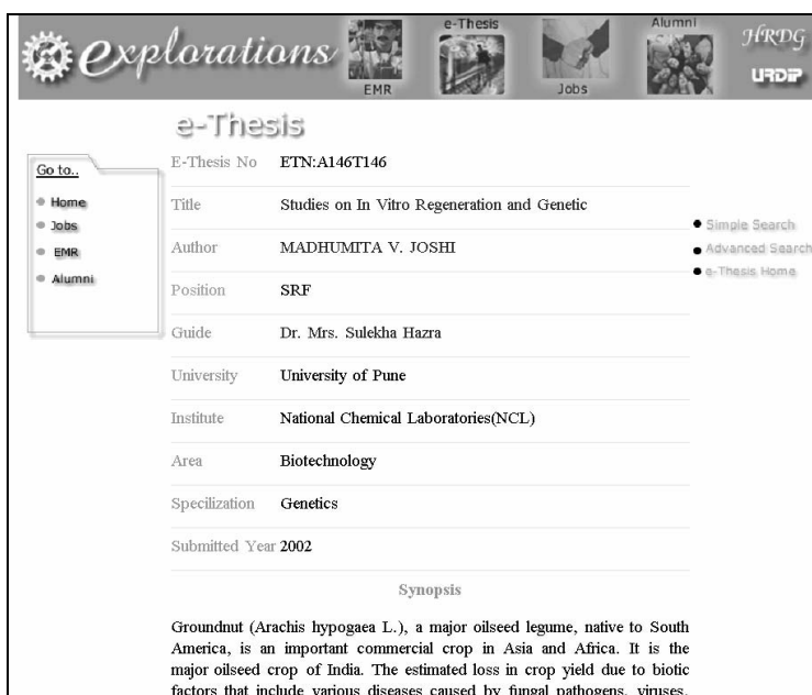
Figure 3: Display Page of Thesis Record in CSIR e-Thesis Database