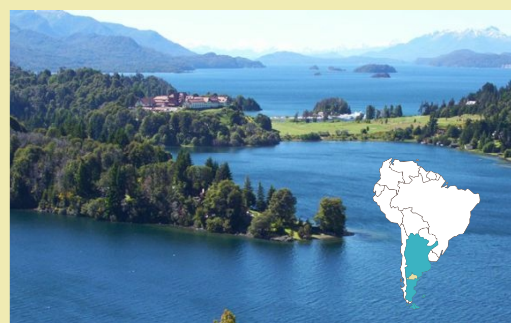
Bariloche, Patagonia, Argentina.